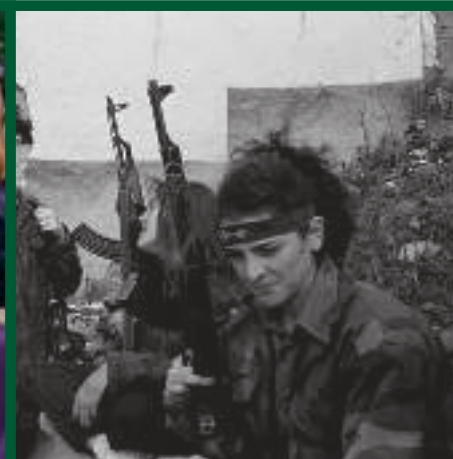
Bosnian female fighter