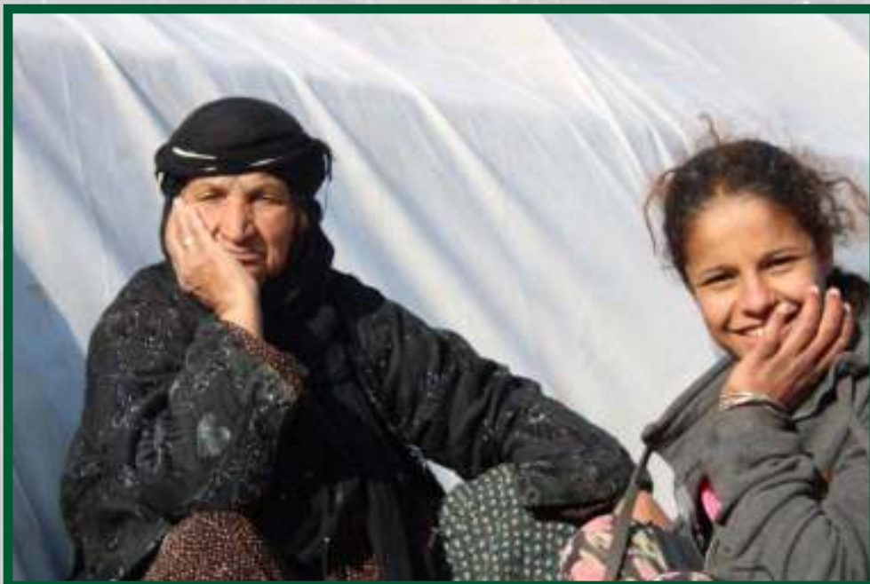
Refugees from Serêkaniyê in Washokani camp

Reports of war crimes against women and gender based violence in the occupied cities are released every day. According to data received by the Human Rights Organisation of the Cizire Region, many women were abducted from the regions of Serekaniye and Girê Spî and women in the city were forced to wear black niqabs.