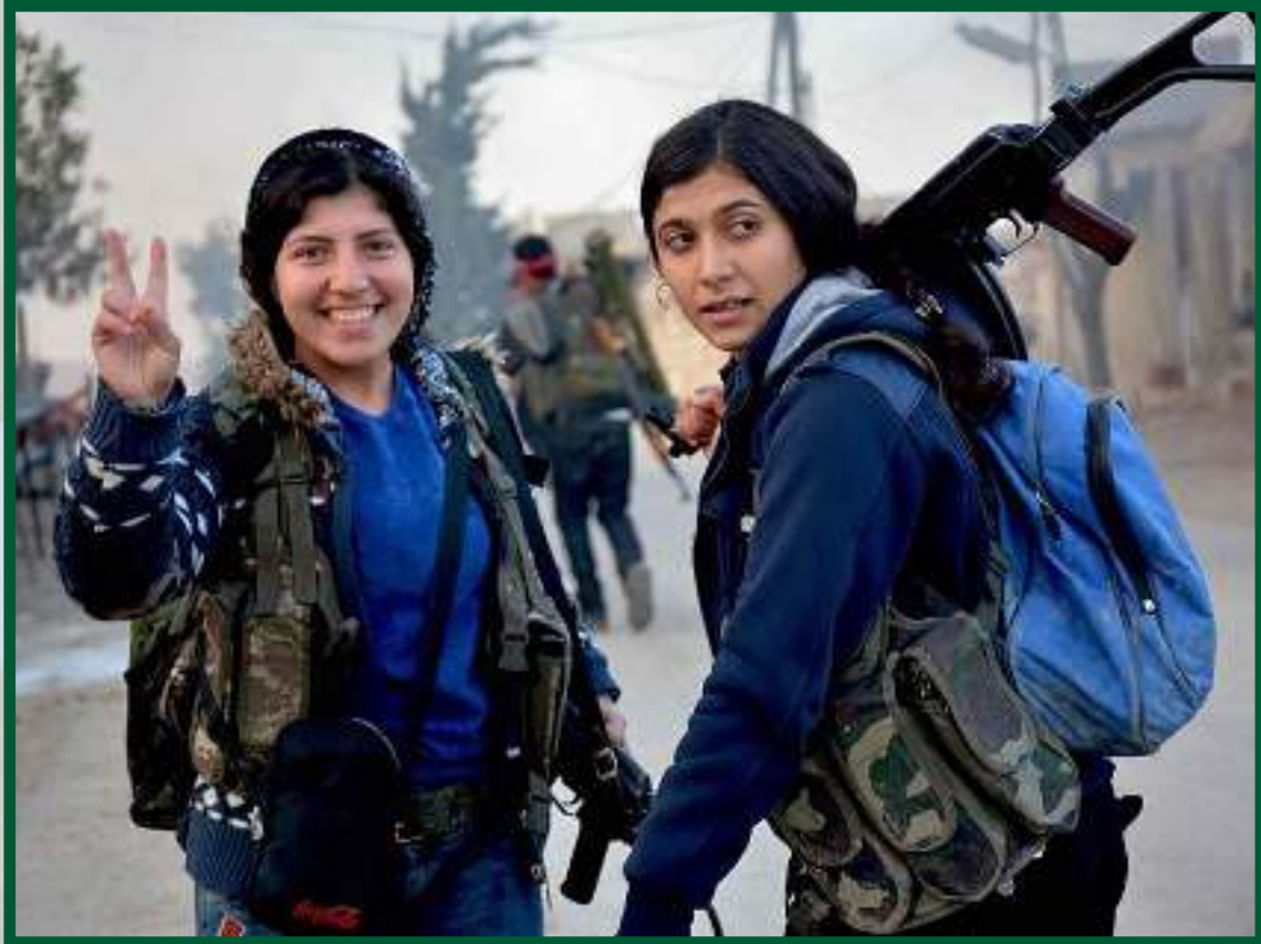
YPJ fighters in Afrin

According to the Afrin Human Rights Organisation, there has been systematic attacks on women and girls. The fate of thousands of women abducted by the so-called 'military police' backed by the Turkish state is unknown. Some of the abducted women were released after a ransom payment.