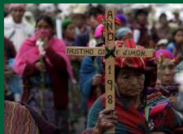
Demonstration of the Sepur Zarco women

One of the many cases occurred during the early 1980s, in the military detachment of Sepur Zarco. Different indigenous Q'eqchi' women were forced to move there after their husbands were illegally detained, tortured, killed and/or disappeared. There they were turned into domestic slaves, raped and sexually enslaved, systematically and continuously for years, by the soldiers who came to rest in the detachment - in some cases until they were killed. In 2012, the women of Sepur Zarco, after a 32 year long fight, managed to make their case the first of this kind ever to be tried by a national court.