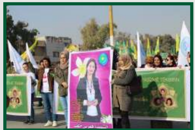
Demonstration in Heseke on the International Day for the Elimination of Violence Against Women