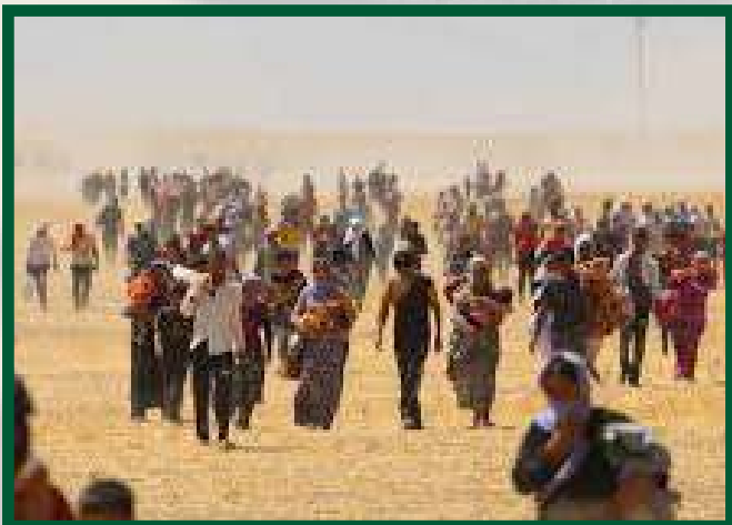
The people of Sinjar escaping IS in 2014

The century-long genocide and femicide against the Kurdish people in the Middle East is still ongoing. It is maintained by the Islamic State and Turkish-backed groups. Kurdish women have shown a systematic organised resistance against a systematic annihilation operation. Kurdish women have formed organised self defence forces against genocide, femicide, and ethnic and religious massacres. The Islamic State, supported directly by the hegemonic patriarchal system and imperialist states, occupied Mosul in June 2014. Then they occupied the Ezidi town of Sinjar. After the retreat of local forces, Sinjar was occupied on August 3, 2014 and the men were killed. The girls and women were abducted. According to the report released by the Platform for Combating Forcibly Abducted Women, 7000 women and girls were abducted by IS. The fate and whereabouts of many of those women is still unknown. The guerrillas of YJA Star (Free Women's Units) and HPG (People's Defence Forces), the self defence forces of the PKK, were those who first went to Sinjar to liberate the Ezidi women. Tens of thousands of women fleeing from jihadists were protected by YJA Star guerrillas on Sinjar Mountain. Ezidi women organised themselves to form their own self defence units (YJŞ) in 2015 and fought hard to liberate Sinjar from IS. Many of the women previously captured by IS were freed by the YJŞ.