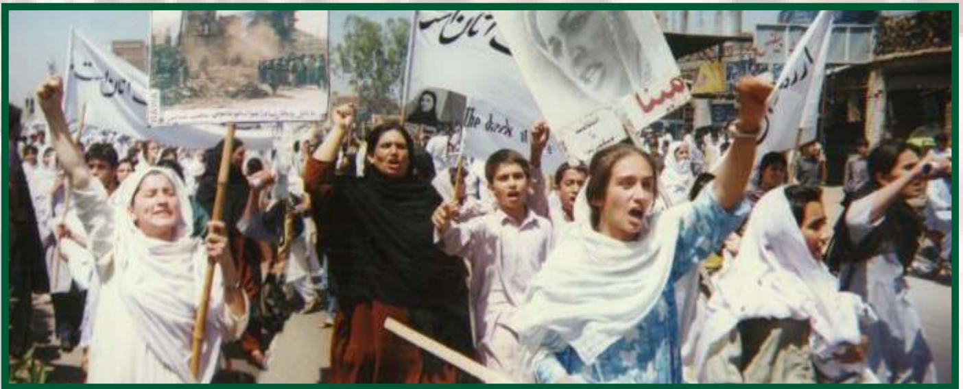
RAWA demonstration 1998

We see the same story in Afghanistan, occupied by the Soviets in 1979 and the USA in 2001. According to international reports, occupation forces raped hundreds of women, forced women to act in pornography and sold Afghan women to human traffickers in other countries. The tradition of women's resistance in Afghanistan, which has become a battle ground for the imperialist states vying for power, dates back a long way: women founded the Revolutionary Association of the Women of Afghanistan (RAWA) in 1977 against occupation and patriarchal religious violence. RAWA still maintains its grassroots resistance and represents women's self defence in the country along with other women's organisations.