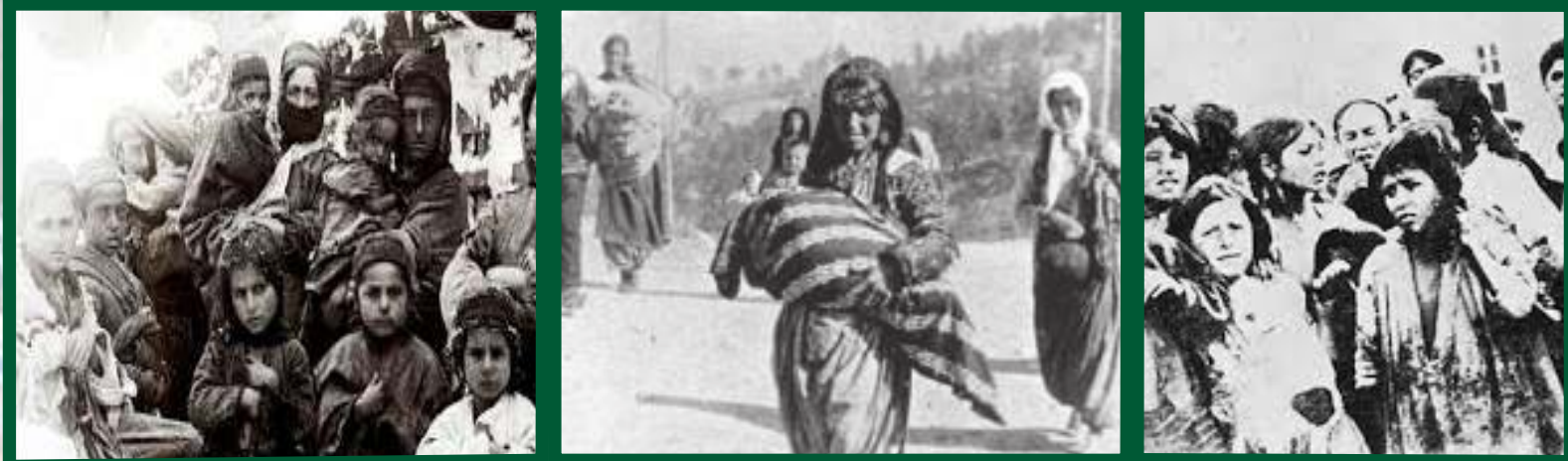
Armenians fleeing the Genocide