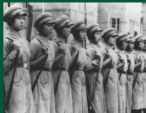
Chines womens forces

Korean, Taiwanese and Chinese women formed self defence units to resist Japanese occupation. The presence of more than a hundred village self defence units formed by women in China during that period reveals the scope of women's resistance.