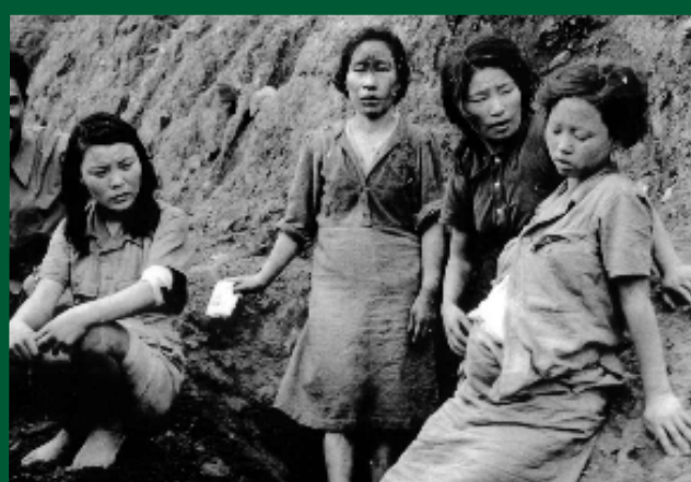
South korean "Comfort women"