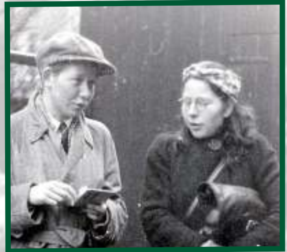
Truss Oversteegen and Hannie Schaft

When they were just teenagers, sisters Freddie and Truss Oversteegen ambushed Nazi officers and collaborators in the Dutch resistance.