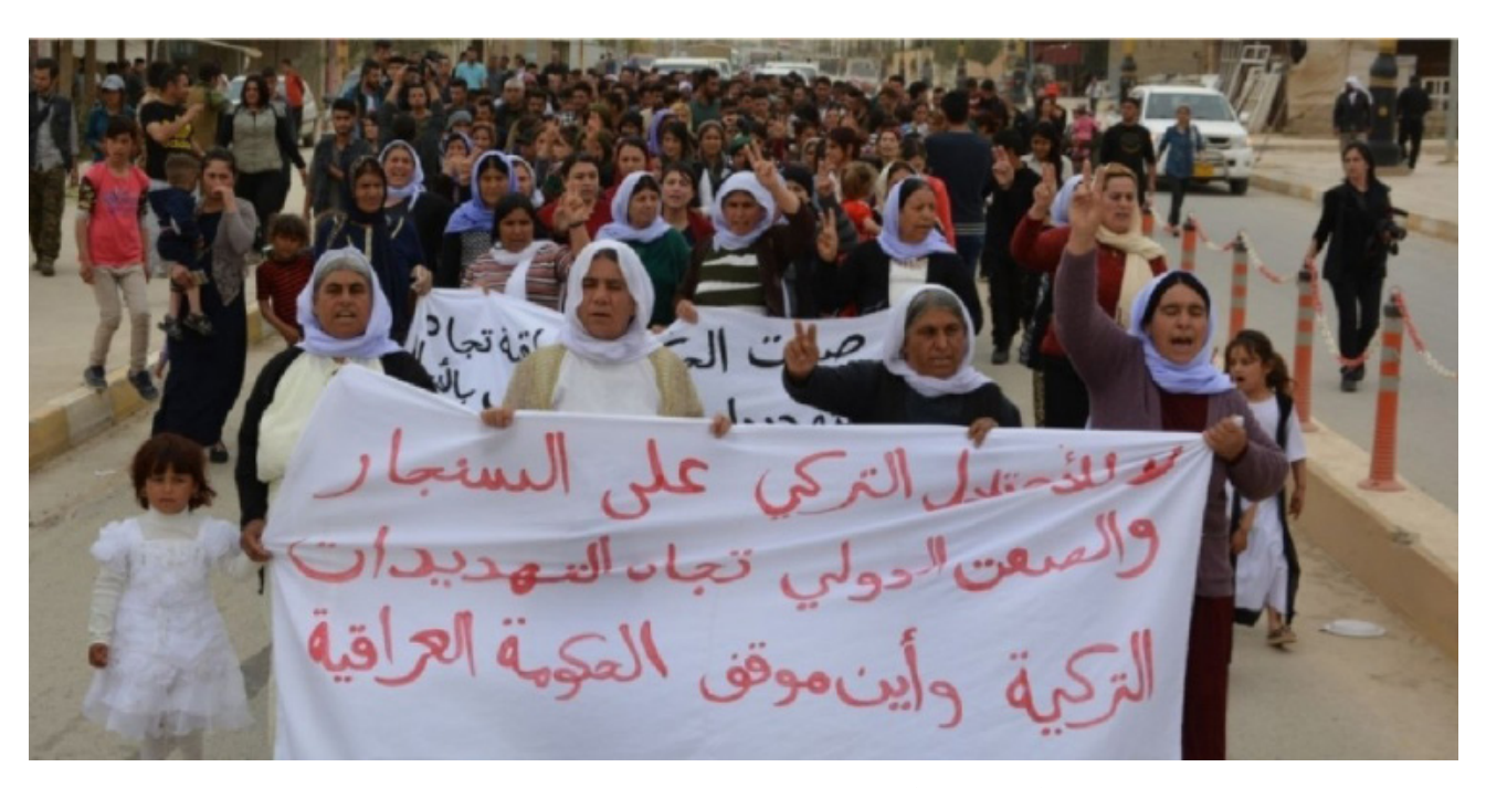
Demonstration of Yezidi women. Source: ANF (29/03/2018)