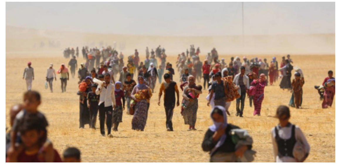
Yezidi flee Shengal.

Throughout history, Yezidis have been subjected to numerous massacres, beginning in the nineteenth century, ranging from the Anfal operation to the Sinjar massacre. Throughout their long history, they have been subjected to seventy-three genocides, the last of which was committed by the terrorist organisation ISIS. It was described as genocide and ethnic cleansing of the Yezidis. This genocide took place after the war between ISIS and the Kurdistan region in northern Iraq began. On August 3, 2014, the organization stormed the Shengal region to expand their area of influence, after the Peshmerga forces withdrew suddenly and without any resistance, leaving its people facing their inevitable fate, where tens of thousands of people were forced to flee to Sinjar for fear of the ISIS brutality and were trapped there for several days, where many of them died there because of hunger, thirst, and disease while the rest fell at the hands of ISIS. The ISIS insurgents also took men, women, and children to the school-yards, isolated the men and killed them (in the Kujo village massacre alone, in the district of Shengal, 500 men were shot dead), and nineteen women in Mosul