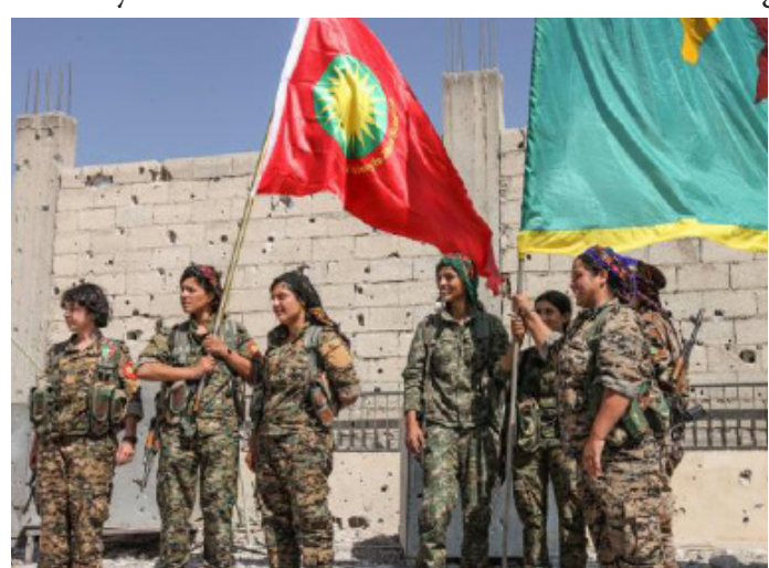
YJŞ and YPJ in Raqqa. Source: greenleft.org.au (23/09/2017)

In retaliation for the suffering of Yezidi women and with the aim of liberating the abducted women, the Women's Protection Units and the People's Protection Units participated in the Shengal campaign to liberate the city of Raqqa, the alleged capital of the ISIS caliphate. The Euphrates Fury Campaign began on November 10, 2016, during which the city of Tabqa was liberated to reach the city centre of Raqqa. The campaign to liberate Yezidi women continued over the next years, with the campaign of Storm Al-Jazeera in Deir Al-Zour, during which the women's protection units played a leading role in liberating more than three-thousand kidnapped women and children from the Yezidis out of 6,417 previously captured. They were brought to the Yezidi Center, the Women's Commission in Al-Jazeera province and psychological support was provided to the freed women. The women's commission would return the Yezidis to their normal lives and help them integrate back into their community, and they were later taken under the care of the Shengal Women's Council who reunited the freed