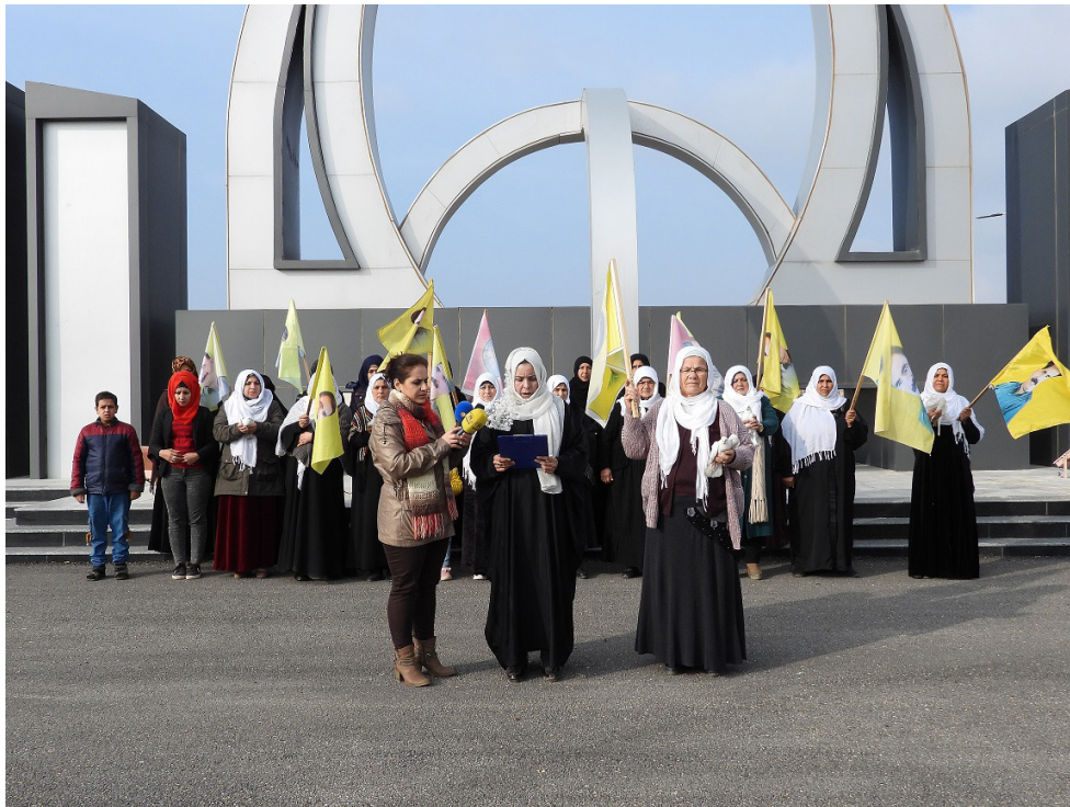
Mother of Peace on December 10, calling out to CPT

The current condition of Abdullah Ocalan, the ideological leader of the Kurdish freedom movement currently imprisoned on Imrali island, remains unclear after a statement from the CPT (European Organization Against Torture of Prisoners) claimed they had been prevented from seeing him the last few times they had visited the prison. Many women all over North and East Syria took to the streets this week in order to demand information about his health and well being: on December 6 in Dirbesiye, on December 7 in Aleppo and Tabqa, and by the Mother of Peace on December 10.