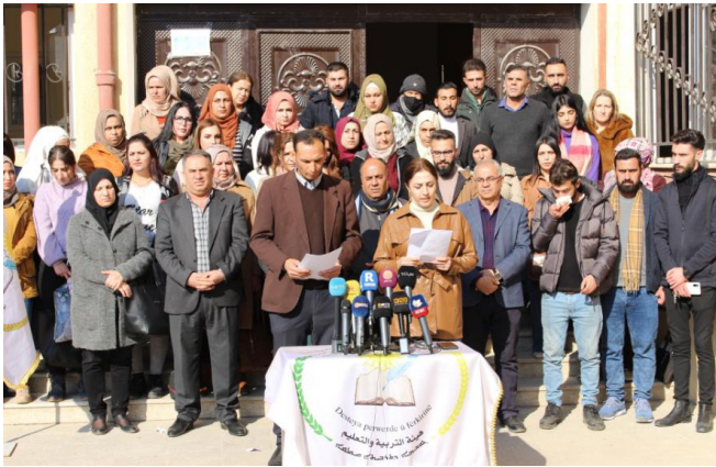
Education Board of the Autonomous Administration

Turkish attacks have lessened for the time being, but still continue. In the district of Eyn Îsa, 200 bombs were fired within one week, and 530 bombs were fired at Zirgan district within two weeks. Turkey is also still repeating its threats to launch a ground invasion into North and East Syria.