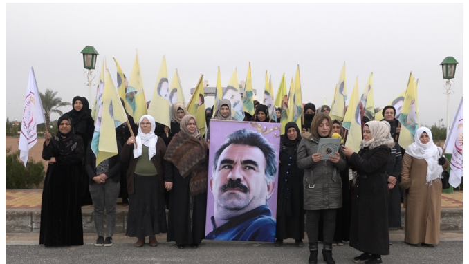
Women's Assembly of Zenubia in Tabqa December 7