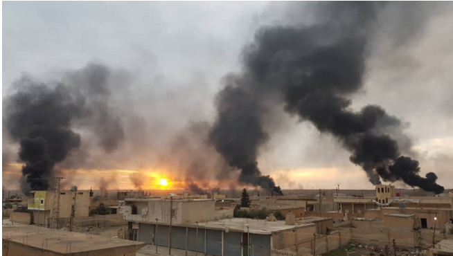
Eyn Isa under Turkish shelling