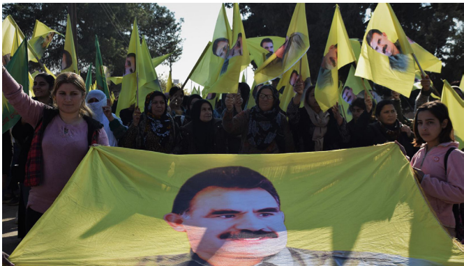
Women in Dirbesiye on December 6