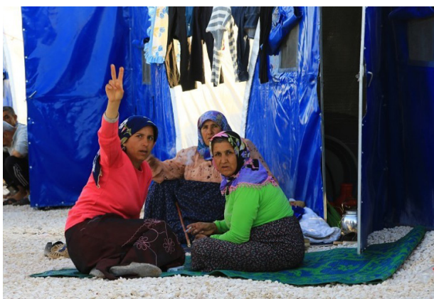
Resistant women in Shebba

Also on December 9, 2022 the Turkish state and its mercenaries attacked the communications tower in Salûk in the district of Girê Spî, which had been providing internet and telephone access for the population in the entire area. It was forced out of service, leaving the whole area without connection to the outer world.