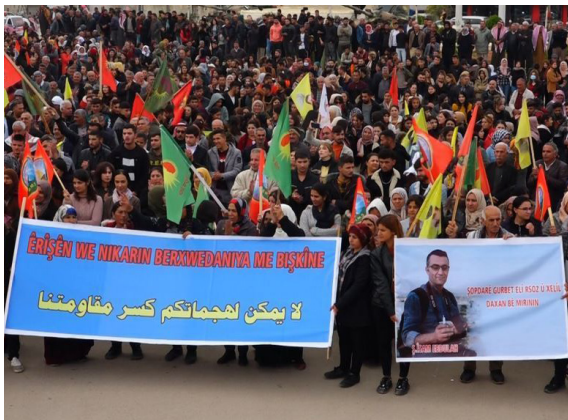
Protest in Zirgan on December 9

On December 9, 2022 the women in Zirgan rose up against the constant attacks on their district and repeated their determination to stay on their land, despite the Turkish occupation's attempts to empty the area of its indigenous population. The co-chair of the council of Zirgan made a statement that three years of constant shelling by Turkey has destroyed a third of their district.